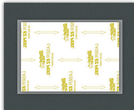
B-PAPER ON A-FILM