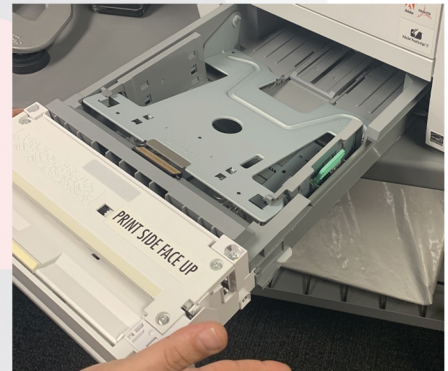
Fully Remove bottom Tray