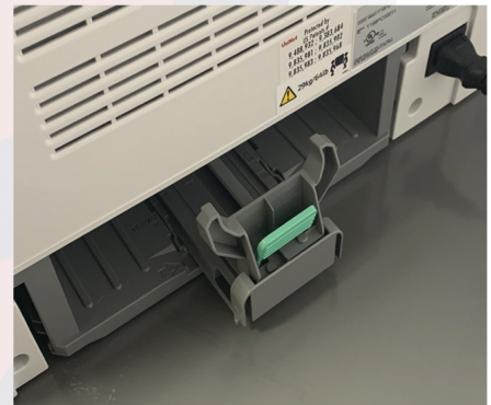
Reinsert bottom Tray