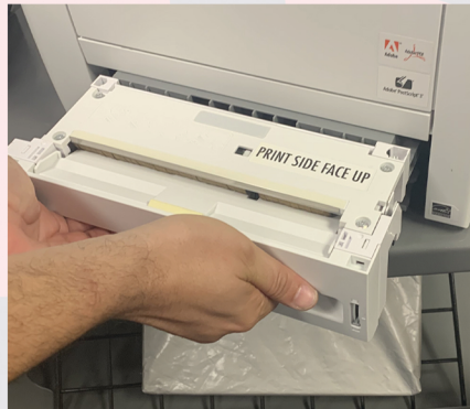
Open Bottom Tray