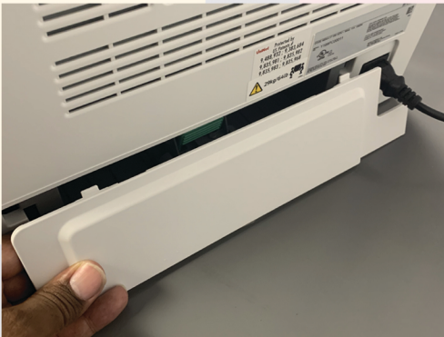
Remove Back cover